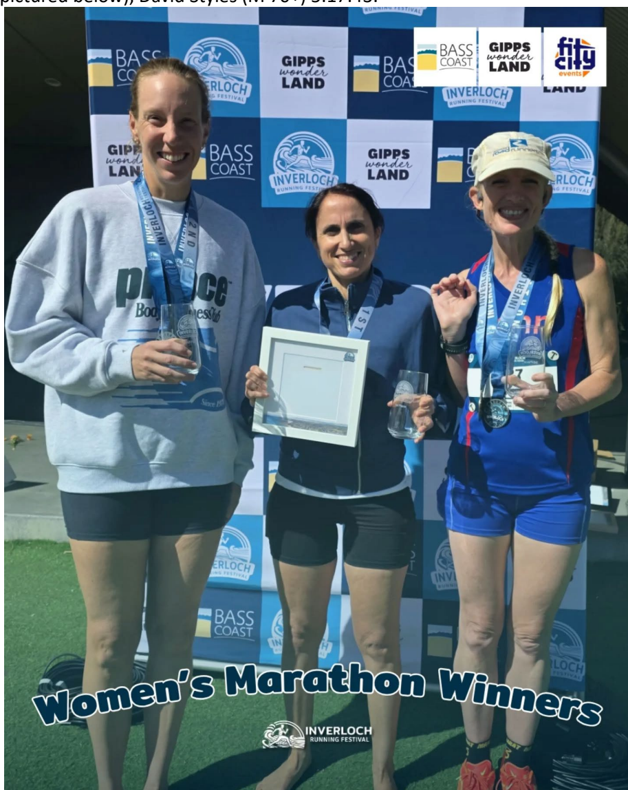
Women's Marathon Winners